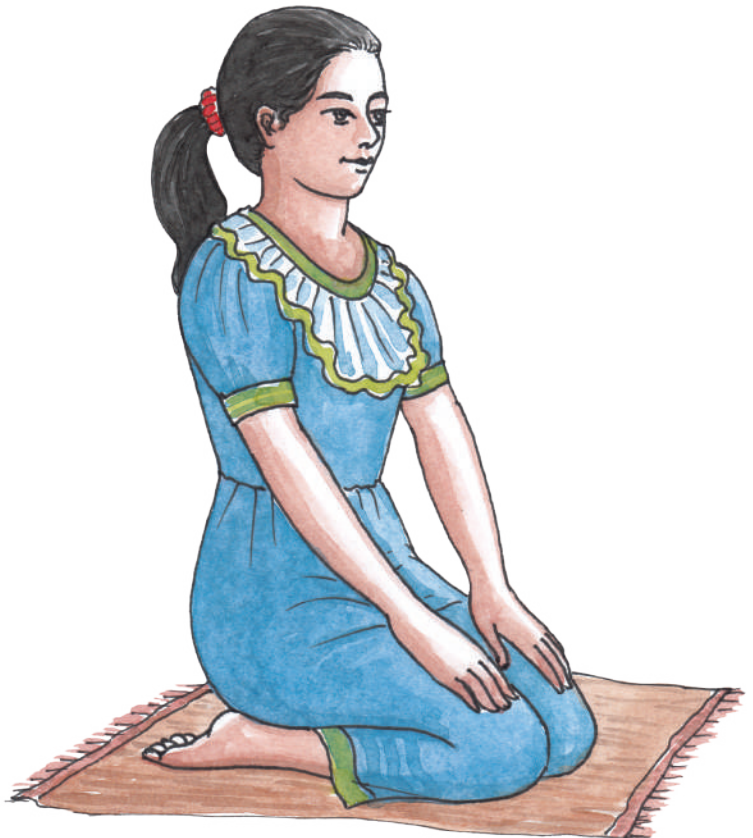
Thunderbolt sitting (Vajrasana)

In this posture, we have to kneel on both knees. The upper portion, the feet should be placed on a soft blanket. One has to sit on the both heels keeping the back position of the body straight. We have to place our two hands straight on two knees. In this position be careful that the anus is to be placed in between the two heels. At the beging, in this posture slight pain in knees may be felt. Later on it will be adjusted. If there is any problem in knees advice should be taken from an expert.