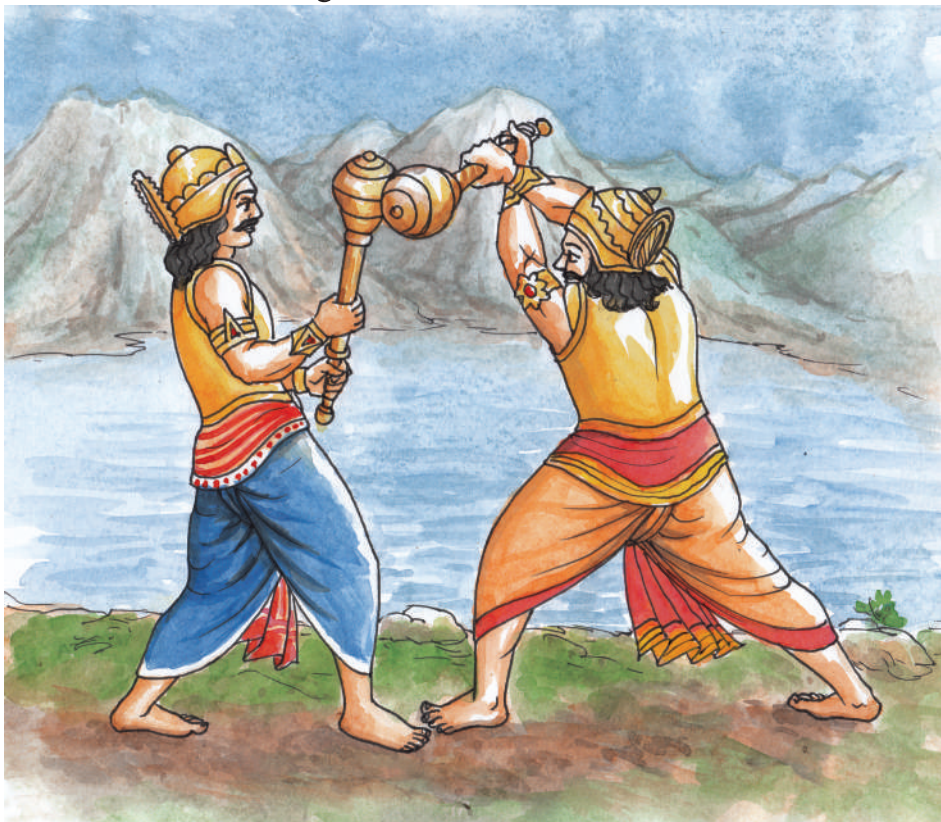
Battle between Bhima and Duryadhana

Karna was followed by king Shalya as the army chief of the Kurus. The fierce fight continued between the two parties. At one stage king shalya got killed by Yudhisthira. Duryadhana's maternal uncle Shakuni got killed at the hands of Sahadeva. Duryadhana fled into the lake of Daipayana. Hearing this the kurus went there. They scolded him severely. Duryadhana came out of the lake. A fierce cudgel fight started between Bhima and Duryadhana. At the heavy stroke of Bhima's cudgel Duryadhana's thigh broke. He fell down on the ground.