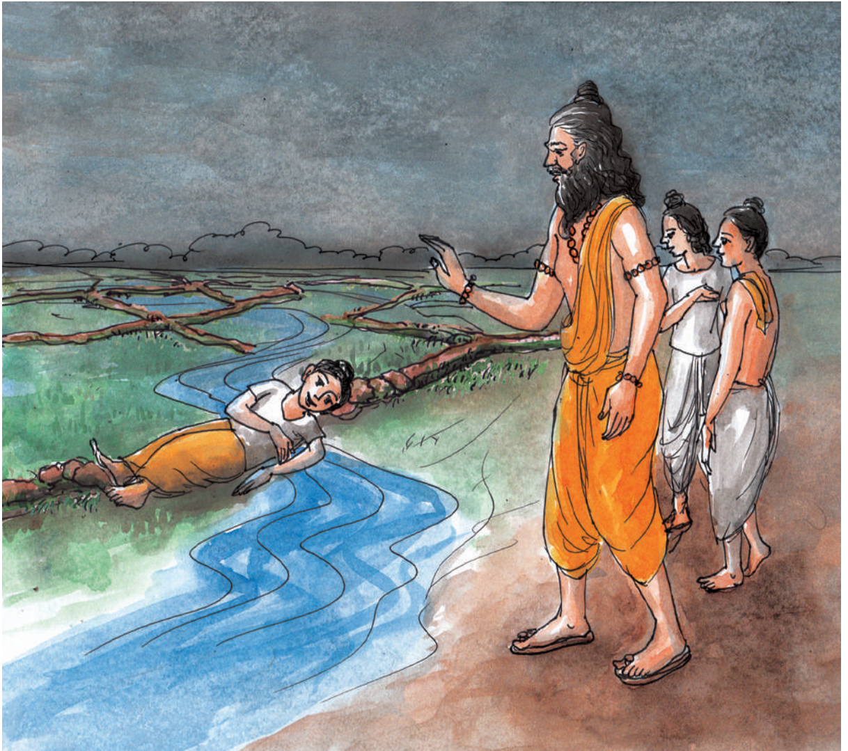
Aruni's Ridge Repairing

One day it was heavy rainfall. The preceptor (guru) called upon Aruni and said to him, 'Water is flowing out from the agricultural land. You shall go and repair the ridge of the land and stop the water stream'. As per preceptor's instruction Aruni went for repair the ridge of the land. He tried a lot but he could not control the flow of rain water. Aruni could not find any other way also. At last, he lay down on broken ridge of the agricultural land and the water flow was stopped.