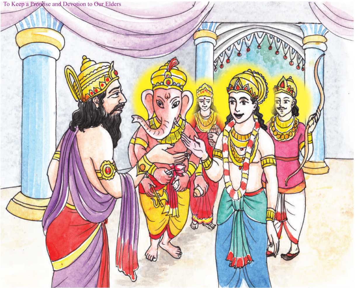
King, Dharmadeva and other god and goddess

One day a potter came with a graceless idol (Alakshmi murti). But nobody bought that idol because, if the graceless idol (Alakshmi murti) came into the house, there could not be the Goddess of Fortune (Lakshmi murti). In that case, it could be an evil for a household. At last, the potter had come to the king. And the king bought the graceless idol (Alakshmi murti) and put it in the palace very carefully. Everyone along with the minister forbade the king to buy it. But the king did not pay heed to it. The Goddess of Fortune (Lakshmi murti) had left the palace for the presence of the graceless idol (Alakshmi murti) in the palace. One by one, Ganesha, Kartitka, Saraswati all gods and goddesses left the palace. Following them the god of religion and justice (Dharmadeva) also wanted to leave. At that time, the king asked him, oh, Dharmadeva, why are you going?