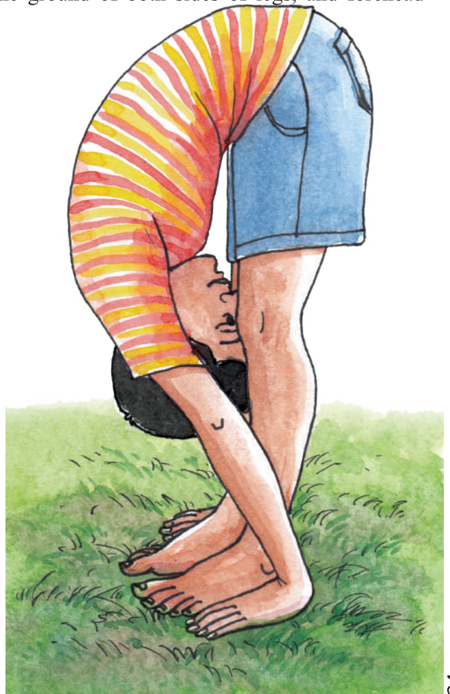
Leg-hand posture (Padahastasana)

This posture (Padahastasana) reduces the abdomen. As a result stomach, liver intestine, gall bladder etc., become healthy. By this constipation, weakness, diabetes etc., get cured. It