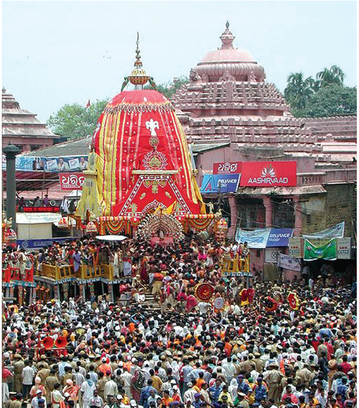
Jagannatha's Chairot March

Jagannatha's Chariot March is the one of the main festivals for Hindu religion. Jagannatha's Chariot March (Rathayatra) is celebrated in the second day of lunar bright fortnight in the month of Ashaah. The Chariot March of God Jagannatha at Puri is world famous.