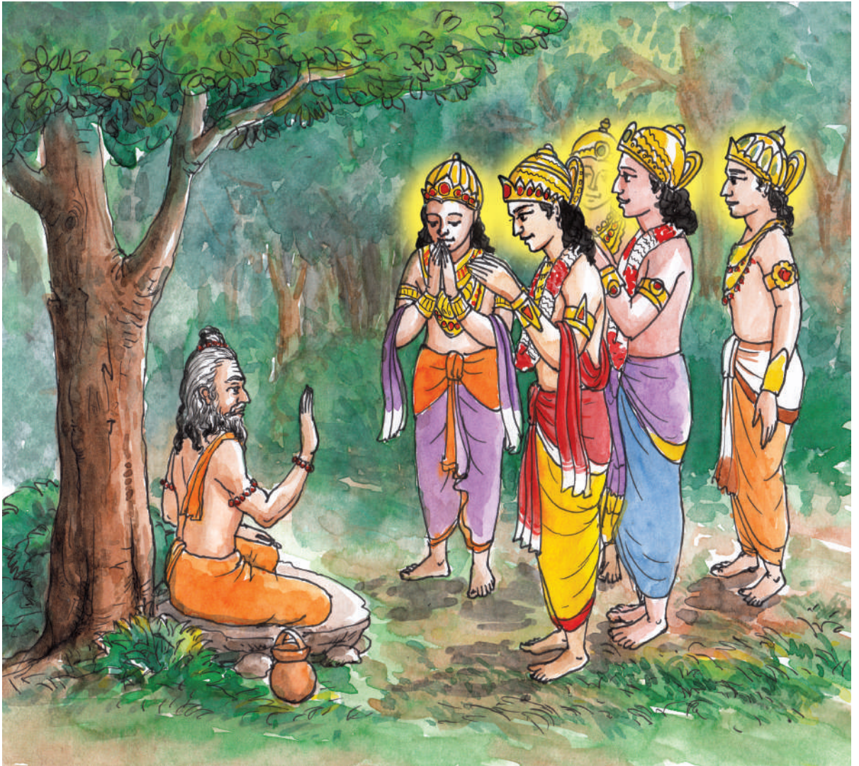
Devaraja Indra with other gods and saint Dadhichi

to engage himself in the ascetic pursuit of meditation in that deep forest. He prayed and prayed for the welfare of all. At that time there grew a demon named Bntra and the demon turned into a strong force. Moreover, he obtained a boon from the god Shiva by pleasing him. Gods and goddesses grant boons when they are pleased at someone's prayer. The boon-seeker may be a god, human or demon. The boon that the demon Britra obtained from the god Shiva was that he would not die at the stroke of a god's weapon or a demon's. With the boon received from Shiva, Britrasura became all the more powerful. He conquered Heaven, the kingdom of the gods and goddesses. He drove away all the gods-goddesses including chief god Indro, from Heaven. Then Indra went to the god Shiva with all the gods expelled from heaven. Then Shiva advised them to go to the world of Vishnu. Vishnu would give you right advice.