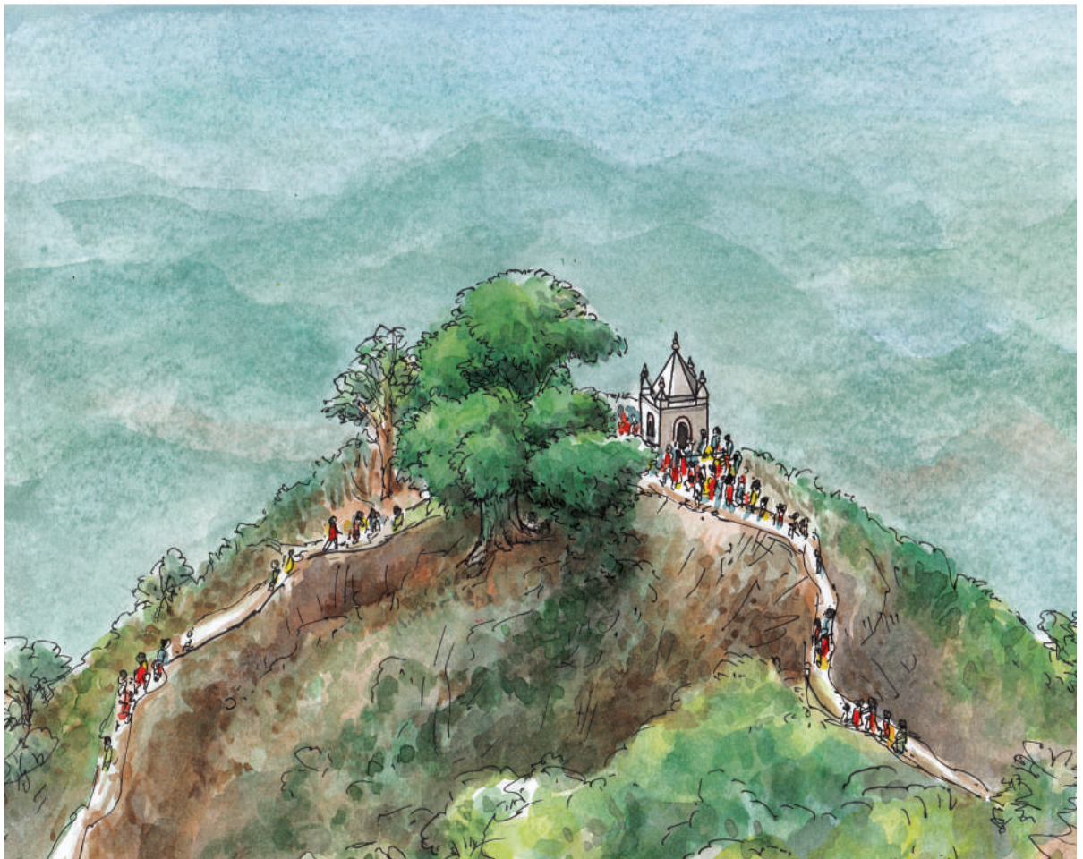
Temple of Chandranatha

The temple of Chandranatha is on the top of a hill. It is also called as Chandranatha dham. The hill is called Chandranatha hill according to the name of Chandranatha. Shiva is another name of Chandranatha. A big fair takes place in the lunar forth night (shivachaturdashi) in Chandranatha. Many people from home and abroad gather in this fair. The natural scenery of Chandranatha is very charming. Here visitor's mind becomes pure. We will visit Chandranatha on getting a chance.