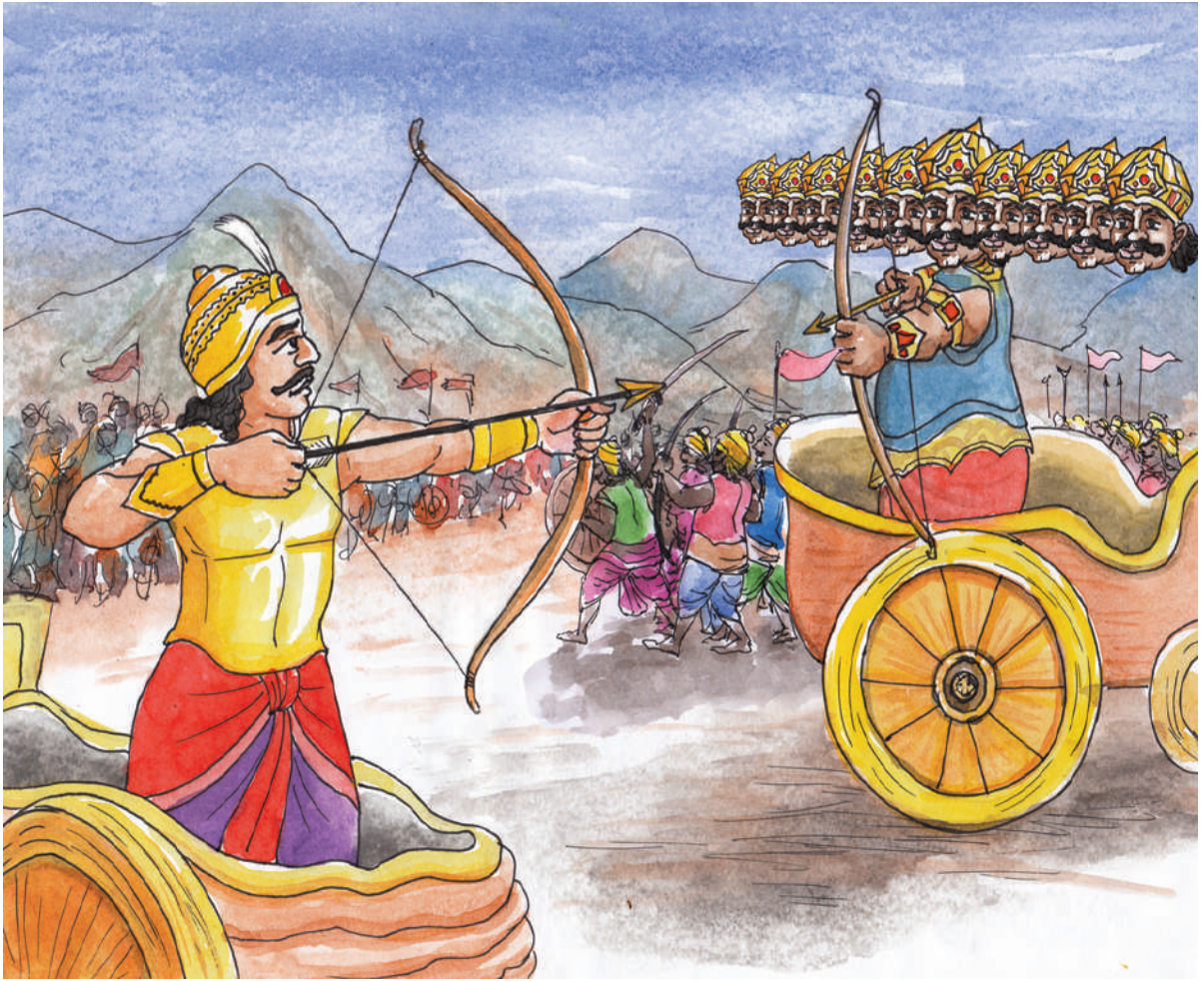
Kartavirya with Soldiers and Ravana's Fightings

Kartavirya addressed his army with a loud voice, 'Soldiers, if defeated, the country would go under foreign domination. Protect the independence of the country.'